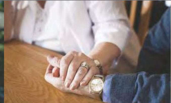
TRANSITIONS CAN ASSIST YOU