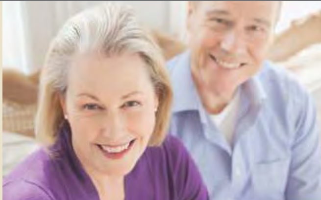
LOCATIONS THROUGHOUT CANADA

Transitions works with empathy and compassion. We specialize in handling unique circumstances. Call us today to talk about your personal needs.